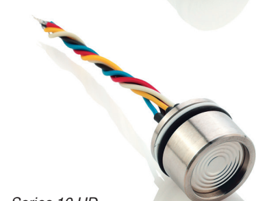
Series 10 HD