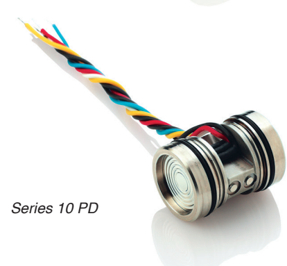
Series 10 PD