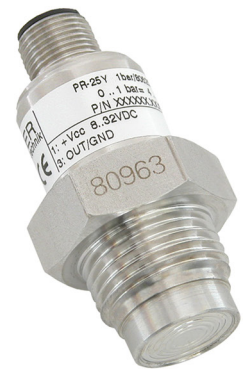
Series 25 Y

A modular concept is used, with fast and economical production achieved by using off-the-shelf sensors. Numerous options and variations are available to meet customers' specific requirements: Pressure ranges, pressure ports, signal outputs, electrical connectors, etc.