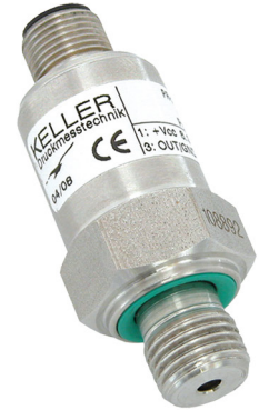
Series 23 SY

The Series 23 SY / 25 Y product line is outstanding due to its extreme ruggedness towards electromagnetic fields. The limits of the CE standard are undercut by a factor of up to 10 with conducted and radiated fields.