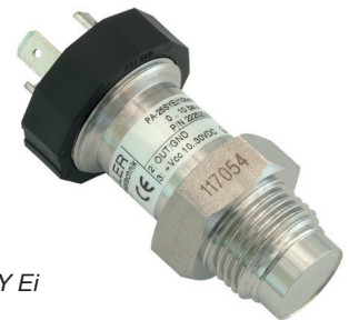
Series 25 Y Ei