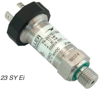
Series 23 SY Ei