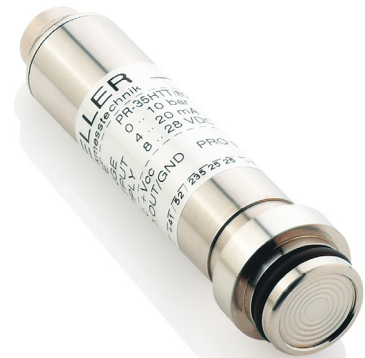
Series 35 X HT