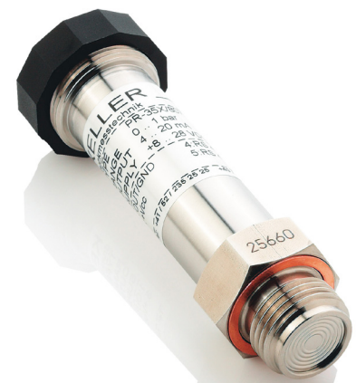
Series 35 X HTT